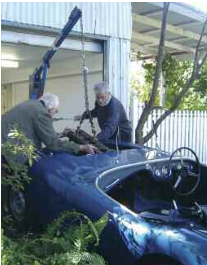
Our first attempt at removal.

The first job was to attach a couple of lifting brackets (courtesy of John Sherman) to the block and with some trepidation the hoist took the weight. The engine mountings were then removed,