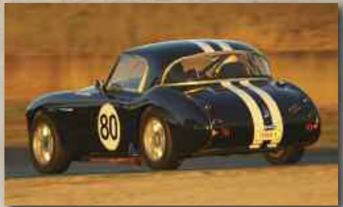
Is it only me who likes this view of an Austin-Healey? Colin Goldsmith's 3000 Mk1 at Eastern Creek 26 June 2011.