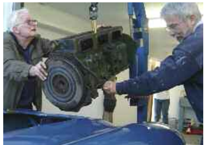
Finally out and swinging in the breeze.