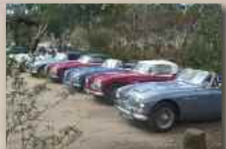
Austin-Healeys at the mid-week run to the Megalong Valley Teahouse.