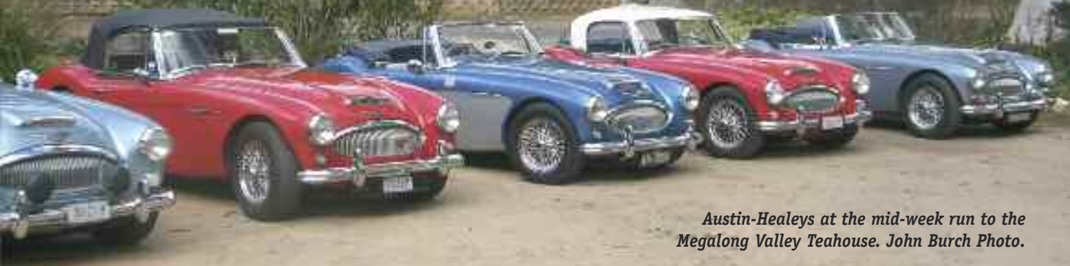
Austin-Healeys at the mid-week run to the Megalong Valley Teahouse.